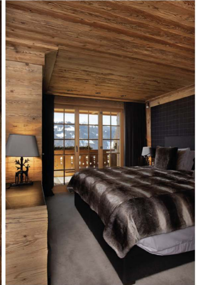
Chalet Colombe in Gstaad can be rented all year long.