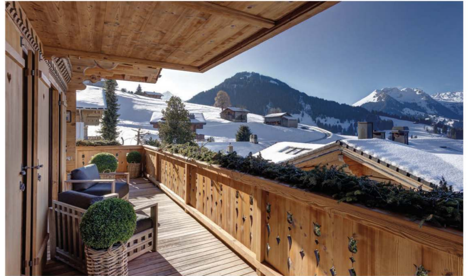
The architecture of Chalet Colombe is by Rieder Bach Architektur Gstaad: exquisite materials which, in combination, offer a cosy atmosphere to spend time in. The building material wood is a very important element, presented here in a refined way.